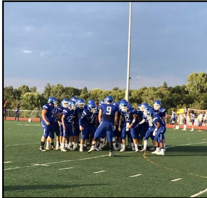
The Blue Dragons all huddle up one last time before taking the field against the Pheasants last Friday. Garretson came away with the 21-16 win to stay undefeated in the young season.